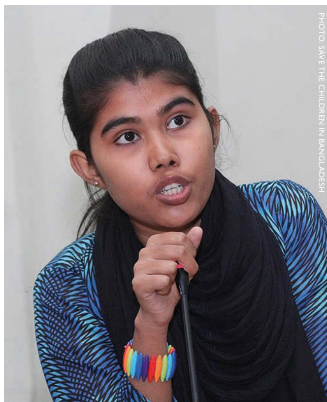
Child budget consultation with the Bangladesh Ministry of Finance on the National Budget, 2019

The use of a variety of methods can also help to create child-friendly spaces, ensuring that approaches are appropriate to the age of the children involved. In this study, the experiences of children and adult participants highlighted the wide range of activities that children can be involved in to promote better participation. While many children's parliaments and councils mirror adult government structures at the national and local level, a range of other activities can be used. Creative activities were seen positively in Bangladesh and Nepal, and children in the Netherlands reported that they enjoyed activities involving a variety of games and learning methods.