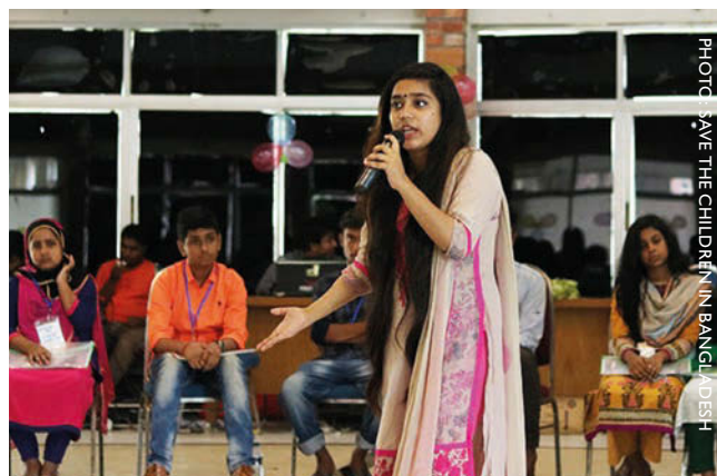
Children at the children's parliament in Bangladesh

Regional evaluation mechanisms such as this, the African Committee of Experts on the Rights and Welfare of the Child and the Association of South East Asian Nations (ASEAN) are important forums for addressing children's rights generally, as well as issues that may be particular to certain parts of the world. In Zambia, the State party report to the African Committee included issues raised by children themselves without any influence from civil society, while in the Philippines, support for a national children's forum would be stronger if it also acted as preparation for a comparable ASEAN gathering.