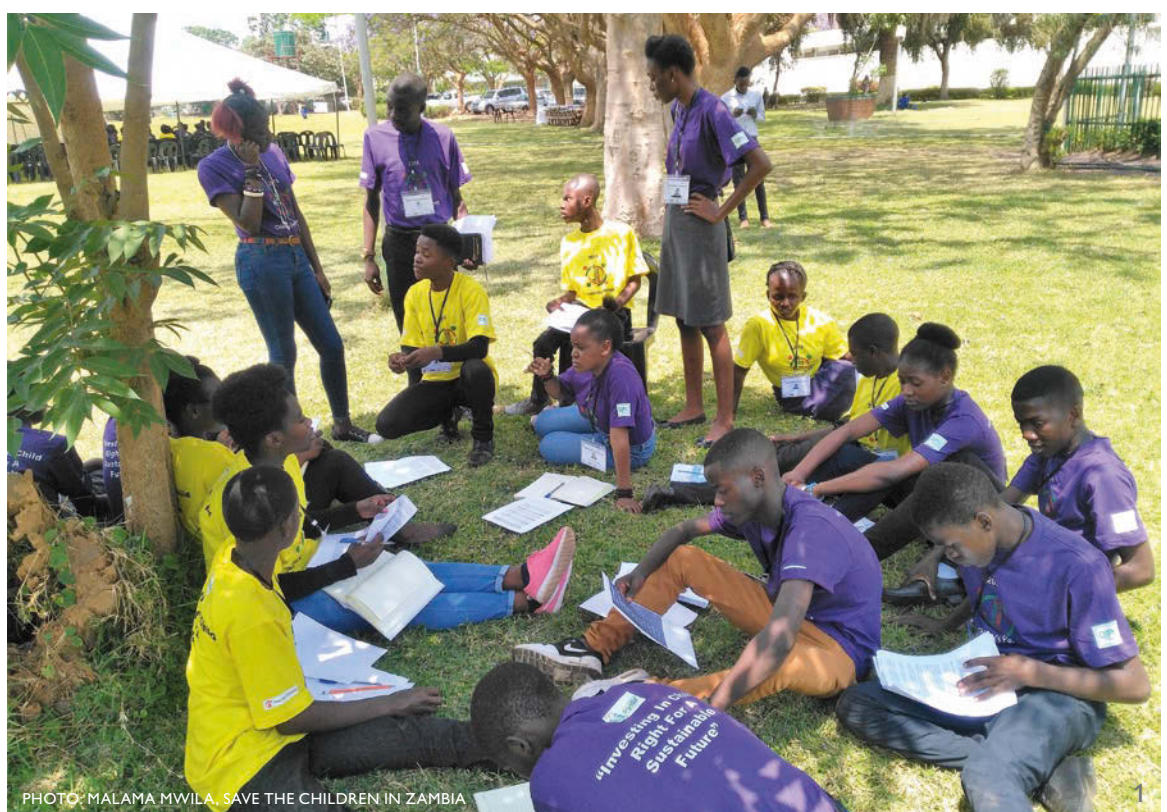
Children from across Zambia discussing the contents of the national budget