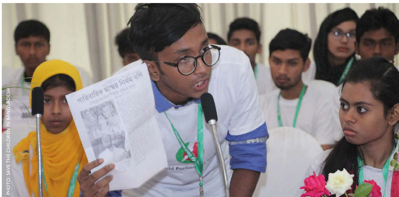
Children at the children's parliament in Bangladesh

guidance on the format, structure, operation and evaluation of all child participatory mechanisms. Sufficient financial and other resources must be made available to ensure mechanisms are sustainable and effective.